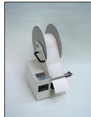
LD-100-RS with Flanges and Counter