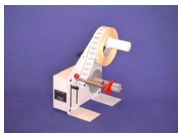
LD-100 / LD-200

Using the latest technology, these versatile Label Dispensers work with nearly any kind of label. With any of the models, you just slide your roll of labels onto the built-in Core Holder. Then thread the label web through to the take-up spindle and your Label Dispenser is ready for use! Rugged, heavy-gauge steel construction and precision parts yield products of the highest quality. Designed for all-day, every-day use, these Dispensers are backed by LABELMATE's famous 3-Year Parts and Labor Limited Warranty , assuring you trouble-free performance.